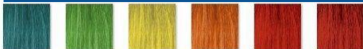
Green to Intense Red