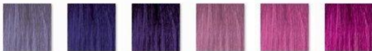
Purple to Magenta